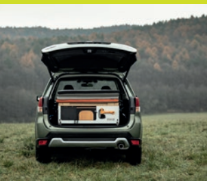
camper conversion kit

Be it furniture or railway stations, the final product must be the transformation of vision into something tangible, its materialization. The final product must not serve its own purposes but respect the context. It speaks for its creators.